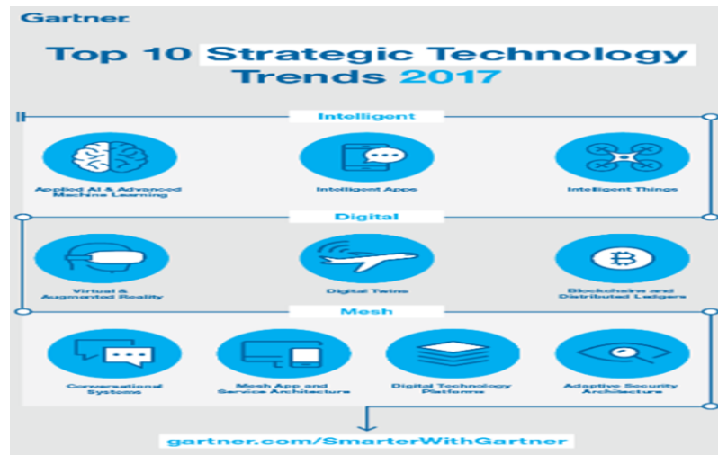
Figure 1. Technology Trends (Cearley, Walker & Burke, 2016)